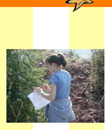
Christina Mejias'06 Flagging a Christmas tree in Acopian Center plots.