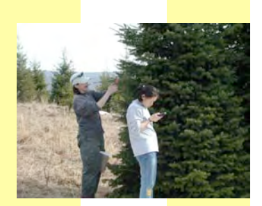
KALYN HOPE'06 ENTERING LOCATION OF CHRISTMAS TREE AND GINA MALLORY'05 FLAGGING TREE.